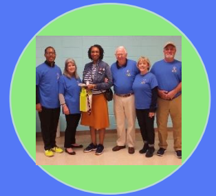
Our Fellowship of Christian Students Team